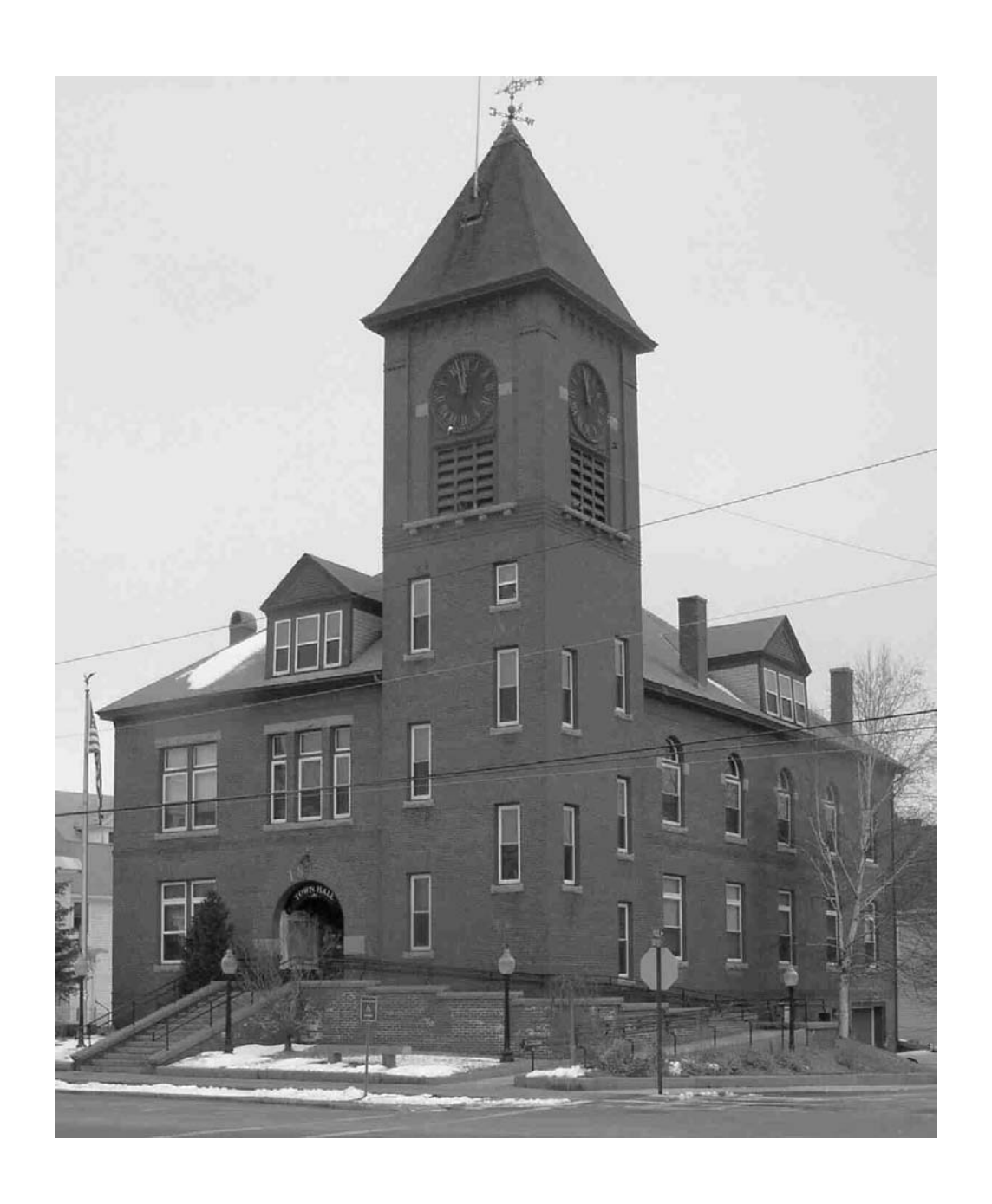
Town of Alton, New Hampshire